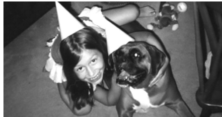
Carmen the Boxer celebrates her birthday in her Tuckerton, NJ home with her friend Nikita. Hey, how about more doggie treats?