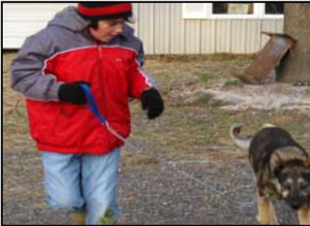
Misty and Nick go for a walk

We have received many calls in the last two years from people who can no longer keep their pets due to their financial situation. In December we took in another 3 such animals. The caregiver had moved out of her home because she could no longer afford to live there. The animals were left in the house alone, with no heat, although the owner said she went to feed them daily. Misty is a sweet 14 year old Shepherd-Husky mix, and with the exception of some incontinence, is in amazingly good shape for her age.