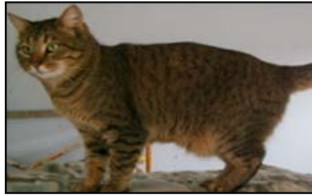
Sushi with inquisitive green eyes

Jessie is a very young, small ferret that was found outside as a stray. Because she has had to fight to survive on the streets, we are working on her socialization skills. Jessie needs a quiet caregiver who is experienced with ferrets and who can help teach her that life is much kinder on the inside!