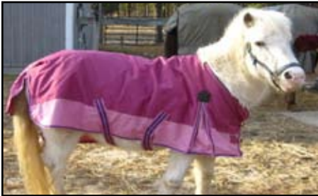
Poomba shows off his new attire!