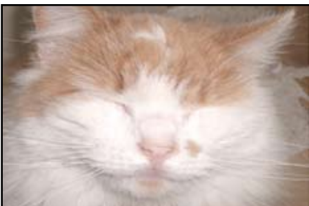
Bismark smiles for the camera

Two young adult male cats, Bismark and Sushi were surrendered with Misty. Bismark, (a/k/a/ Bizzy), is a lovely buff & white semi-long-haired cat, also very sweet, about 1 year old. Sushi is a tan & black tabby, about a month younger than Bismark. Both cats are very friendly and are up for adoption. Because of her age and incontinence issues, Misty will most likely stay with Oasis for the rest of her life. Sponsor to help with her care would be greatly appreciated.