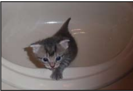
Sapphire in the sink

Oasis received a call just after Hurricane Irene blew through New Jersey with its incredible winds, tornadoes, and heavy rain. A tiny kitten somehow survived the tempest, alone, and was found under a porch in Williamstown. She was brought to Oasis yowling from fear and hunger. Too young for kitten food, the baby was bottle fed special kitten formula around the clock by her foster family. They named her “ Sapphire ” for her incredibly beautiful blue eyes.