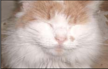
Bismark smiles for the camera

Our Adoption Program offers animals that are vetted, up to date on age-appropriate shots, socialized, de-wormed, and sterilized. Adopt two animals, and receive a 20% discount off the already reasonable adoption fees.