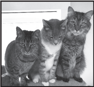
JULIE-MOM, BOOTS & MINDY