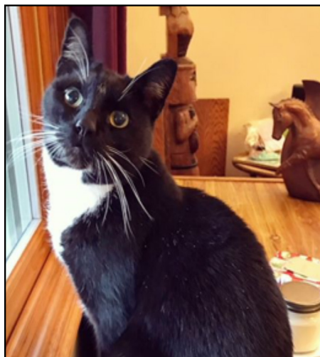
Andre is looking forward to a new home in at Cat Cottage – unless he finds his forever home first!

The cat cottage renovation has been slow but steady. New windows were installed and the walls and ceilings are now down to the studs. The old floor was broken up and removed. All of the old bathroom fixtures and the rotted kitchen cabinets have also been removed. We are awaiting the electrician and plumber for their work to be completed. If you would like to contribute to the Cat Cottage renovation, please call 856-262-1222 or visit our website at www.oasisanimalsanctuary.org .