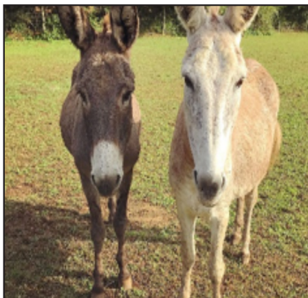
Molly & Dolly

Our resident donkeys are doing very well with their socialization with humans and have become a favorite with the volunteers at the farm. Their legs have healed completely and their hooves no longer hurt due to their past overgrowth. "The girls" are quite the attraction at the farm!