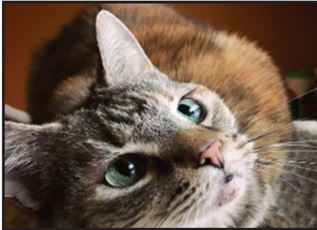
Miss Kitty (F)

Miss Kitty was returned to us by her new caregiver because she did not get along with the other family cat. Miss Kitty is a beautifully marked calico with striking green eyes. She is very affectionate towards people but apparently prefers to be an "only cat" so she can keep all the adoration to herself!