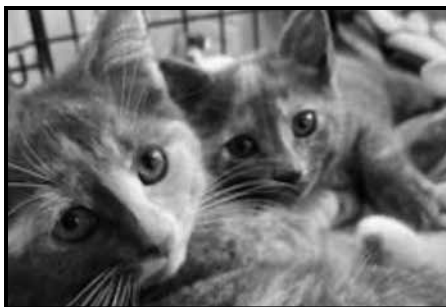
SESAME AND KIMCHI