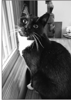
Andre - Black and White Male Tuedo

We have others looking for their forever home! Please check out our website at www.oasisanimalsanctuary.org to see them all – in color!