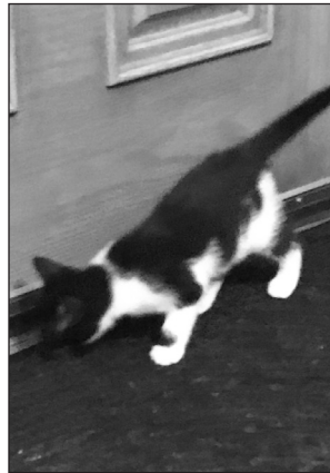
Charli - Black and White Female Kitten