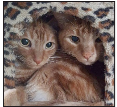
Morgan & Bailey