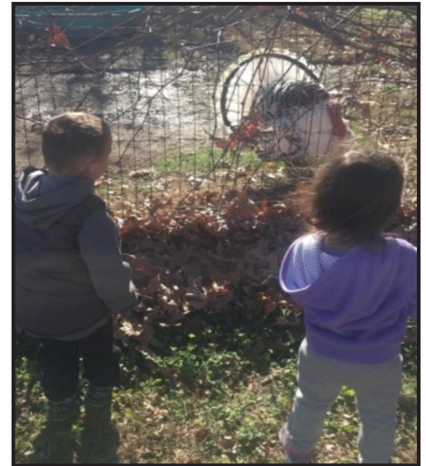
Zeus, in all his splendor, delights the children