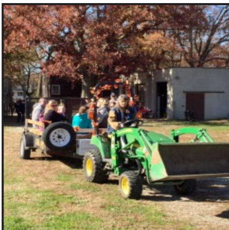
A gorgeous day for a hayride around the farm!

“Laughter is the sun that drives winter from the human face.”