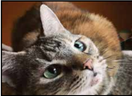
Miss Kitty (F)

Miss Kitty was returned to us by her new caregiver because she did not get along with the other family cat. Miss Kitty is a beautifully marked calico with striking green eyes. She is very affectionate towards people but apparently prefers to be an "only cat" so she can keep all the adoration to herself!