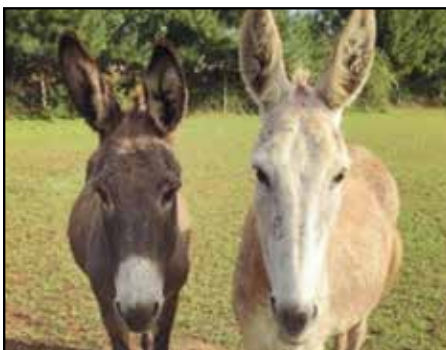
Molly & Dolly