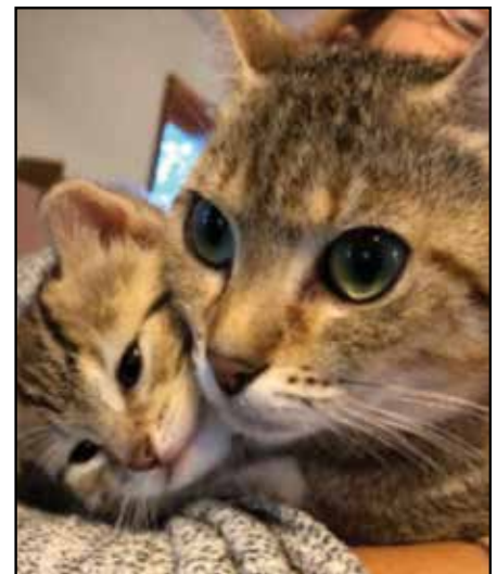
Jade & Sapphire

A former feral cat from Gloucester City, NJ, little Miss Jade became a momma at just 6 months old herself. She gave birth to 4 babies; sadly only 1 survived. Sapphire is Mom's pride and joy; and was named for her beautiful blue eyes. As soon as the kitten is weaned, Jade will be spayed, and Sapphire will also be sterilized when she is big enough. Jade is quite the doting mother over her little one and we are hoping the two can be adopted together.